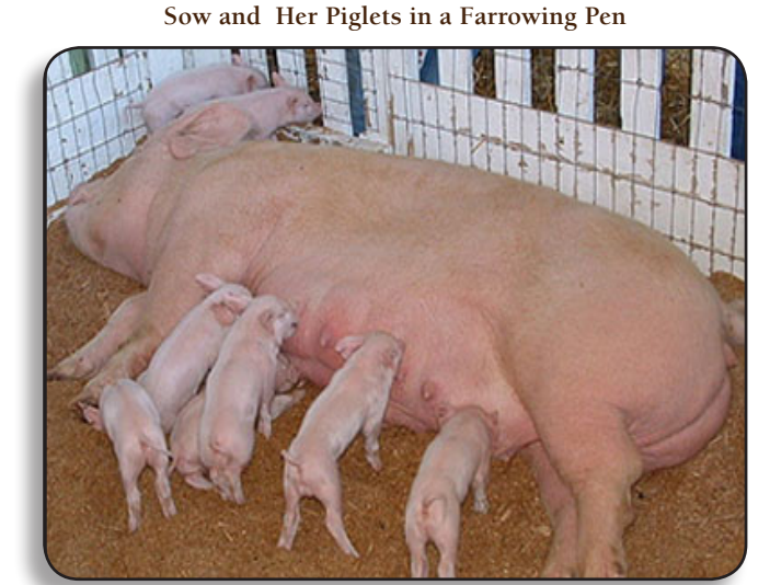
Keith Weller, USDA ARS

<u>Farrowing</u> Just prior to farrowing, pregnant animals are moved to individual pens or stalls