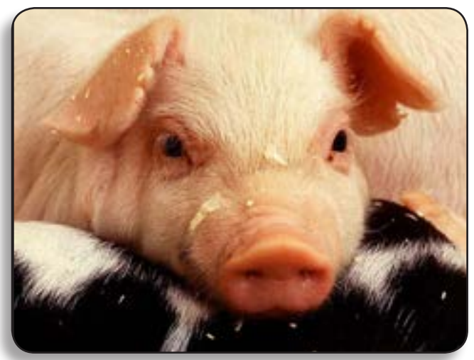
Scott Bauer, USDA

Recently, two new viral infections of swine have been identified in the U.S. swine population: porcine epidemic diarrhea virus (PEDV) and porcine delta coronavirus (PDCoV). Together these viruses are responsible for a condition described as novel swine enteric coronavirus disease (SECD). In suckling piglets, PEDV causes a severe disease characterized by acute watery diarrhea, vomiting, loss of appetite, and dehydration; are fatal in 50 to 80% of affected piglets. PDCoV is believed to cause a similar disease in suckling piglets. Both viruses are only known to affect swine and are not threats to public health. Efforts to develop vaccines to protect pigs against these diseases are ongoing.