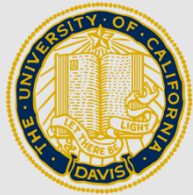
University of California, Davis, USA