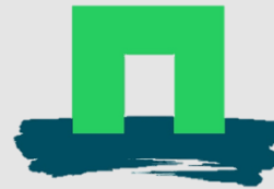
Wageningen University & Research, Netherland